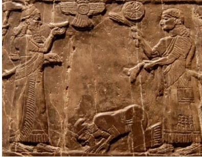
Israelite king Omri prostrate before Shalmaneser III: this is the meaning of the term most commonly translated worship in both the OT and the NT. Black Obelisk, British Museum

a. Bowing or kneeling --2 Chron. 6:13; 29:29; Psalms 5:7; 95:6; Isa. 45:23; Dan. 6:10; Matt. 2:11; 8:2; 17:6; 28:9-10; Acts 20:36; 21:5; Rom. 14:11; Eph. 3:14; Phil. 2:10; Rev. 22:8.