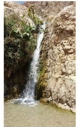
Ein Gedi in Israel; for people who spent centuries in Egypt's flatlands, springs were a marvel (dmy)