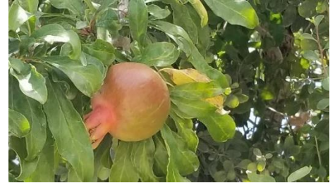
A pomegranate still on the tree in Israel (dmy)

The antidote to ingratitude is _____, for it keeps before us the source of our abundance.