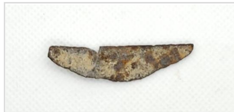
Small 7 th century BC iron blade found at ancient Lachish. Smelting was a difficult but invaluable technology in ancient Israel (dmy)