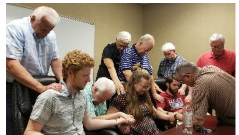
NB elders lay hands in prayer on the Eugene, Oregon team before they departed. The Bible considers this an act of worship

13. Assembling with the believers. Lev. 23:4ff.; Josh. 24:1ff.; Neh. 8:1ff.; Psalm 35:18; Acts 2:42-47; 4:23ff. 20:7ff.; 1 Cor. 14; Heb. 10:24-25; 12:22; Rev. 4-5.